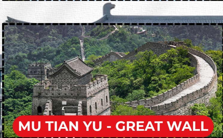
MU TIAN YU - GREAT WALL